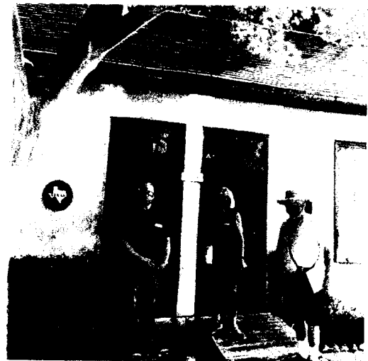
Comal CHC appointees perform conditions assessments summer 2020.